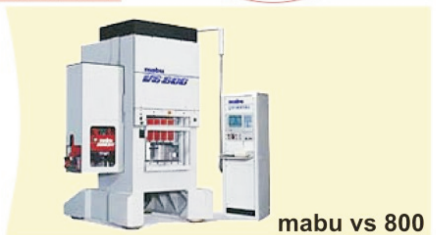
mabu vs 800