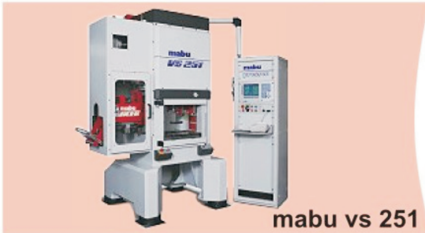
mabu vs 251